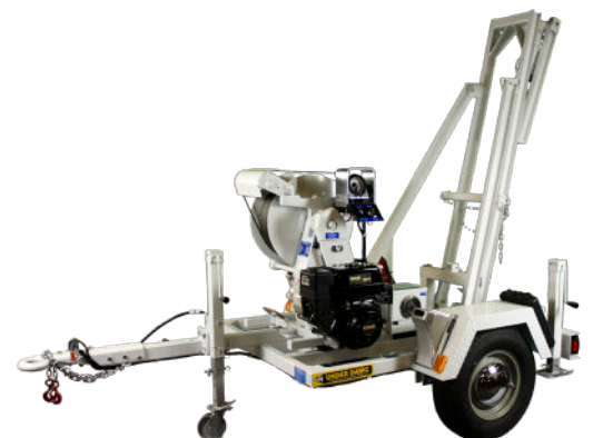
Shown with A-frame Adapter