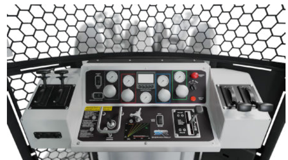
PLW-400H Control Panel