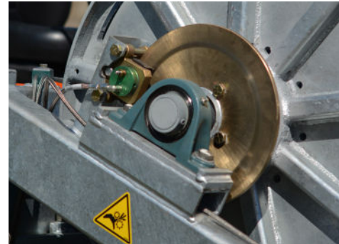
Braking System with Electric-Over-Hydraulic Activation