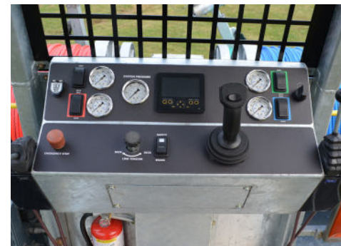
Ergonomic Operator's Station