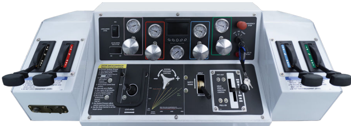
PLW-200H Control Panel