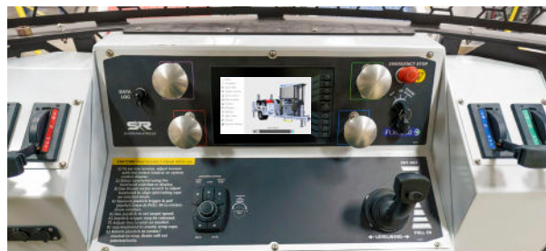
PLW-200E+ Control Panel

The PLW-200E+ delivers all-electric operation with the Onboard Rapid Recharge system by Sherman+Reilly. This system provides superior performance and automatic battery management so the operator can focus on the job at hand. With all the capabilities of the standard PLW-200H, the E+ model has an all-electric drivetrain designed to exceed all-day use. The Onboard Rapid Recharge system responds automatically, without input from the operator, until the work is done no matter how tough the job gets. In addition, S+R Telematics™ come standard at no additional cost, providing industry-leading support in real time. The E+ Series product line showcases the S+R commitment to transforming customer expectations for job site safety and performance.