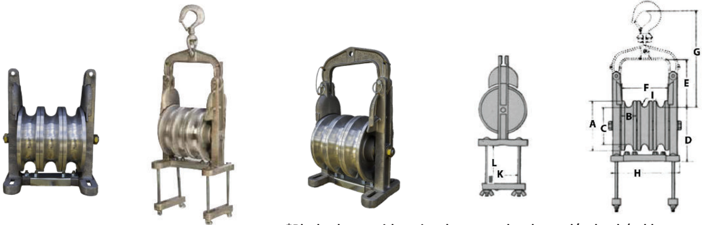
*Blocks shown with optional crossarm bracket and/or hook (sold separately)