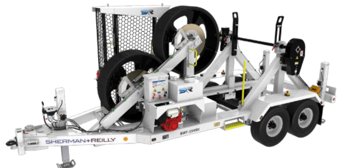
BWT-1545H side view