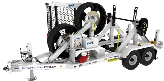
BWT-1545H side view