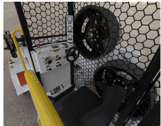
BWT-1363H cab interior.