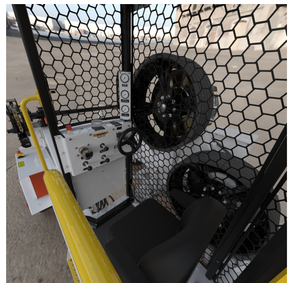
BWT-1363H cab interior.