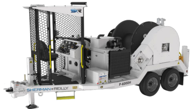
Streetside of P-6000H Heritage Puller