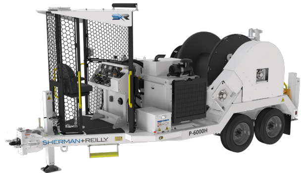
Streetside of P-6000H Heritage Puller