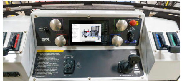
PLW-200E+ Control Panel

The PLW-200E+ delivers all-electric operation with the Onboard Rapid Recharge system by Sherman+Reilly. This system provides superior performance and automatic battery management so the operator can focus on the job at hand. With all the capabilities of the standard PLW-200H, the E+ model has an all-electric drivetrain designed to exceed all-day use. The Onboard Rapid Recharge system responds automatically, without input from the operator, until the work is done no matter how tough the job gets. In addition, S+R Telematics™ come standard at no additional cost, providing industry-leading support in real time. The E+ Series product line showcases the S+R commitment to transforming customer expectations for job site safety and performance.