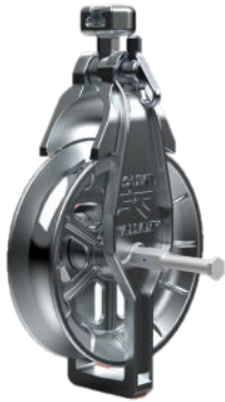
XL-100 block shown with optional ground