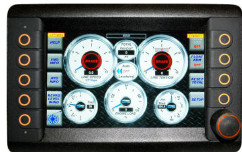
P-1400X Control Panel