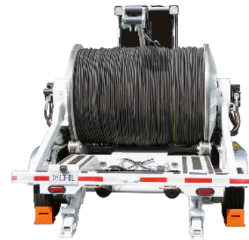
Rear view of the P-1400X Puller