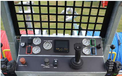
Ergonomic operator's station