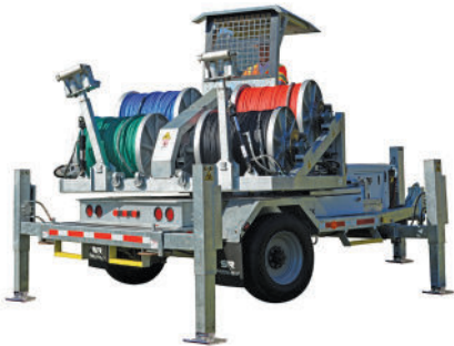
Shown with optional galvanized finish