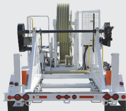
Rear view of the BWT-1545 Bullwheel Tensioner