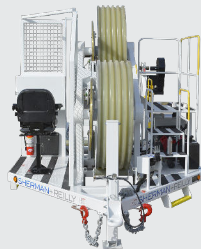
Front view of the BWT-1545 Bullwheel Tensioner