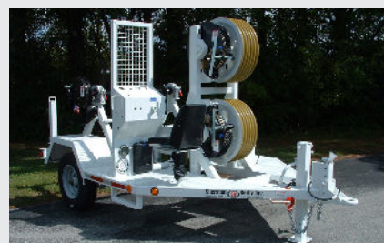
BWT-1303 Bullwheel Tensioner