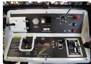
Heritage Style Ergonomic Control Panel