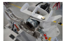
X-Change™ Coupling System