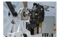
Spider® Pilot Line System with independent levelwind