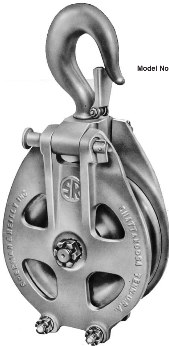
Model No. 4841

For All Types of Rope Including Wire Rope