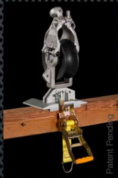
Shown with XS100 block (not included)