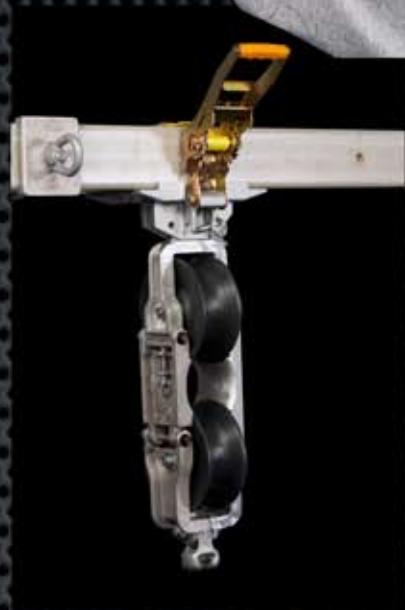
Safely hanging the XS200 Block (not included)